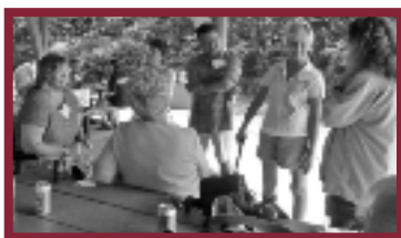
Thanks to friends around the Twin Cities for organizing and sharing a picnic lunch with all of us.