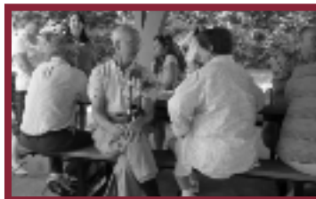
Members of the FSH Society meeting and greeting near the Twin Cities in Minnesota