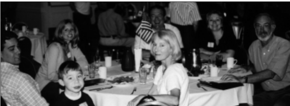
Making new friends and acquaintances at the July 8, 2000 FSH Society Network Day, Natick, Massachusetts.

*Videotaped copies of the extraordinarily informative and educational afternoon program are available from the office of the FSH Society for US$30.00.