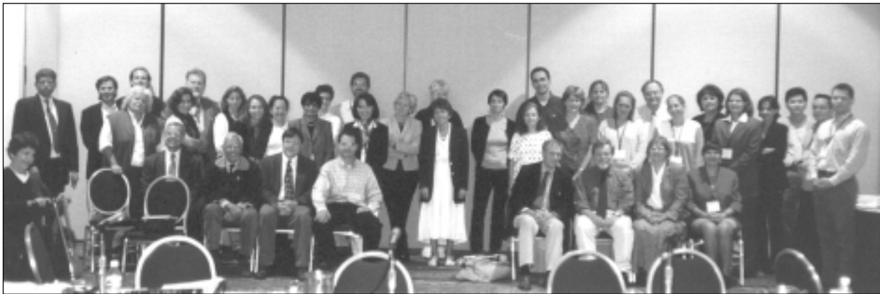
The International team of researchers, clinicians, geneticists and funding agencies working on FSHD at the FSH Society workshop held as a Satellite meeting to the American Society of Human Genetics (ASHG) meeting, Philadelphia, Pennsylvania, October 2000.