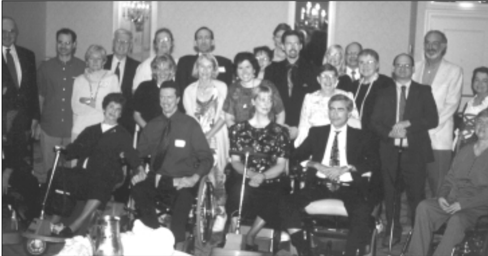
Making new friends and acquaintances at the July 8, 2000 FSH Society Gala, Natick, Massachusetts.