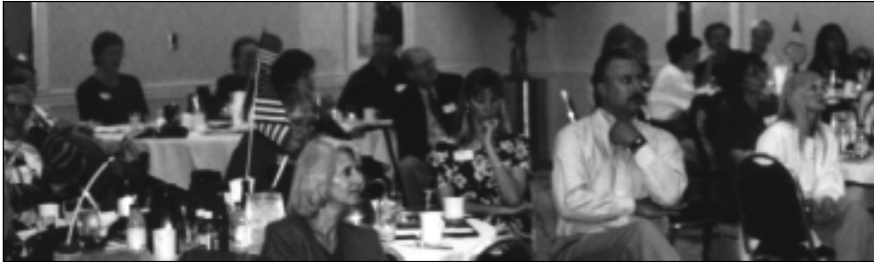
Audience listens to Lectures at the July 8, 2000 FSH Society Network Day, Natick, Massachusetts.

financially to understand what exactly is happening in FSHD and to begin to change its course.